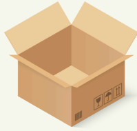
Cardboard boxes (flattened)