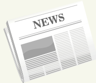
Newspaper & Inserts