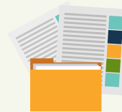
Office paper & folders