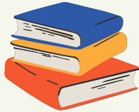
Books (paperback only)